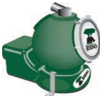
Rhino Environmental Solutions