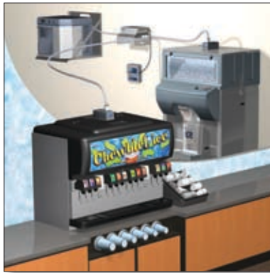
Ice Manager by Follett