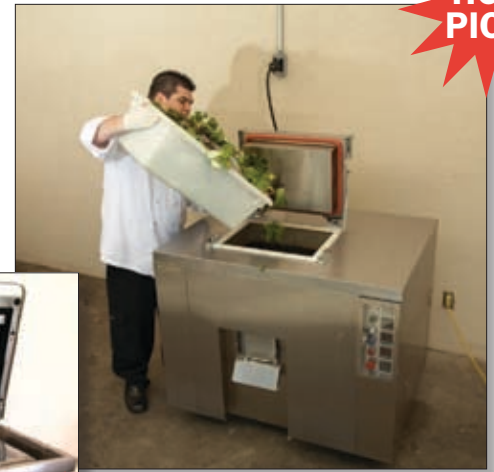
eCorrect waster reducer by Somat